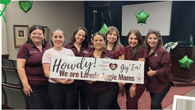
The Laredo - Texas A&M Mothers' Club March 2026 Monthly Meeting.